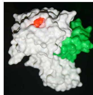
3D Prototype of the CD1 Molecule